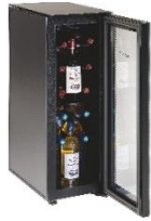
Tete a Tete

Petite cabinet that stores wine and preserves open bottles.